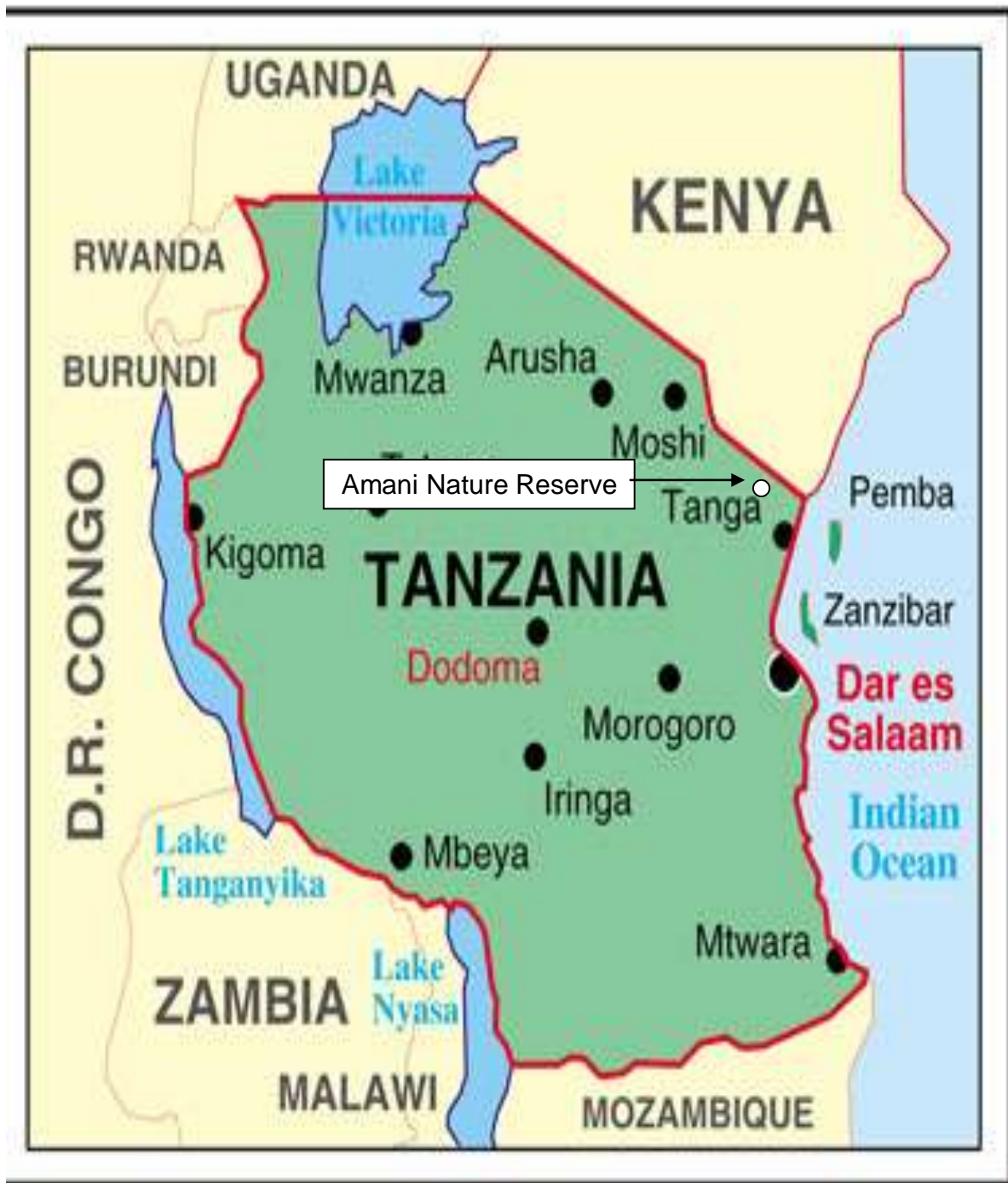
Map 1. Tanzania, showing location of Amani and Dar es Salaam